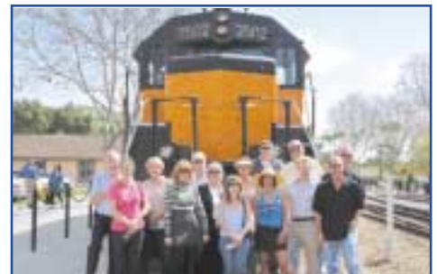
Let's go!!

If you enjoy a walk down memory lane then a trip to Fillmore California is well worth the drive. On Saturday March 20th a group of 18 PCALA members in 12 cars took a delightful drive in terrific weather conditions through the Orange