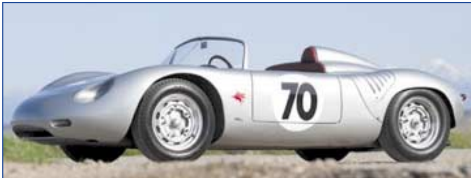
This vintage Porsche racing car was bought at auction by Sir Sterling Moss.

"I was thrilled to learn that it was none other than Stirling Moss who offered the final bid on the Porsche RS61 at our Amelia Island Auction,"