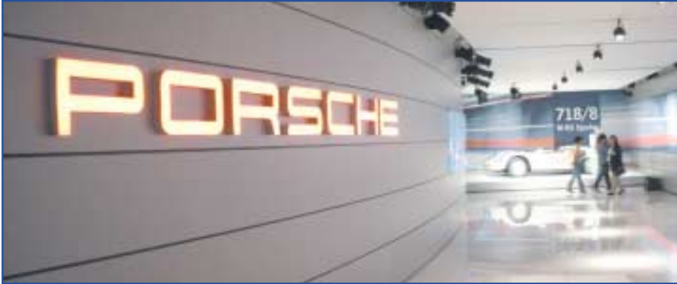
The hallway leading into the Porsche room at the LA Auto Show.