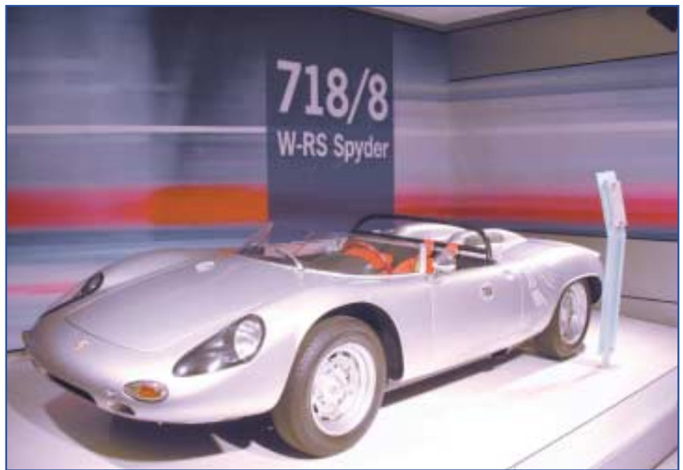
The premier display as you entered the Porsche room at the LA Auto Show.

And other than that it was a relatively worthwhile experience. Porsche continues to make new features and options available to maintain sales and interest in their products.